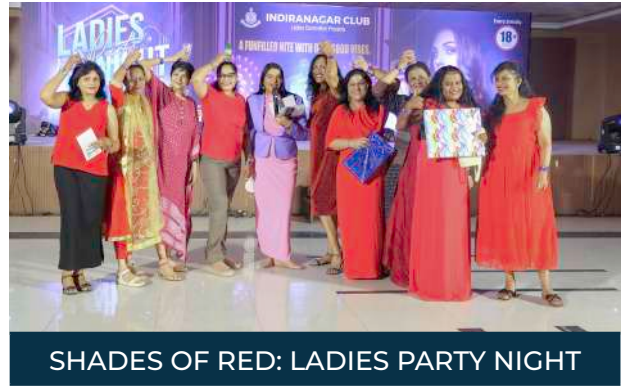
SHADES OF RED: LADIES PARTY NIGHT