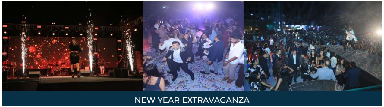
NEW YEAR EXTRAVAGANZA