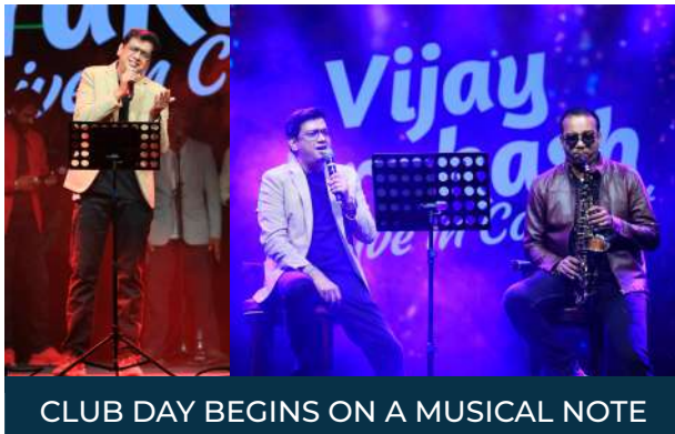
CLUB DAY BEGINS ON A MUSICAL NOTE

The monthly Grand Tambola evenings at the Indiranagar Club continues to see enthusiastic participation from members, making them one of the Club's most popular social events. January's Bumper Tambola featured eight sarees as prizes, while the February Valentine Special delighted members with over 200 wine bottles gifted to participants. In March, designer handbags added excitement to the Tambola event, and April featured special Lucky Lady saree prizes. The much-awaited ₹3 Lakh Bumper Tambola continues every month, with an exciting Tambola Night featuring gift hampers, music, cocktails, and dinner planned next month.