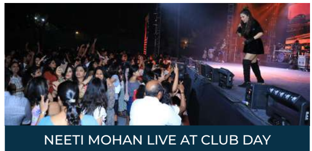
NEETI MOHAN LIVE AT CLUB DAY

Club Day Celebrations – Day 2 came alive with an electrifying performance by Neeti Mohan. She effortlessly connected with the audience, creating a vibrant and engaging atmosphere. Her popular hits like Ishq Wala Love, Jiya Re, Nainowale Ne, and Sau Aasmaan had everyone singing along with excitement. Her energy, warmth, and stage presence made the evening truly memorable, leaving the audience captivated and thoroughly entertained from start to finish.