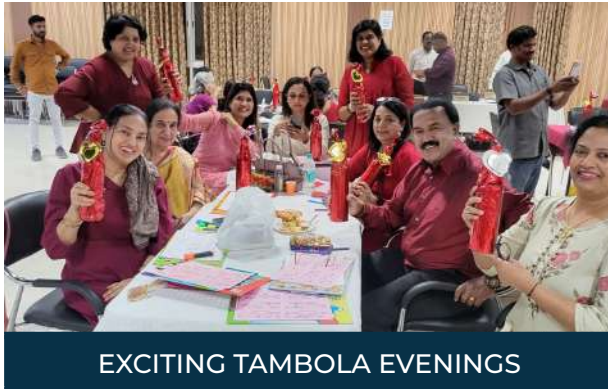
EXCITING TAMBOLA EVENINGS

The monthly Grand Tambola evenings at the Indiranagar Club continues to see enthusiastic participation from members, making them one of the Club's most popular social events. January's Bumper Tambola featured eight sarees as prizes, while the February Valentine Special delighted members with over 200 wine bottles gifted to participants. In March, designer handbags added excitement to the Tambola event, and April featured special Lucky Lady saree prizes. The much-awaited ₹3 Lakh Bumper Tambola continues every month, with an exciting Tambola Night featuring gift hampers, music, cocktails, and dinner planned next month.