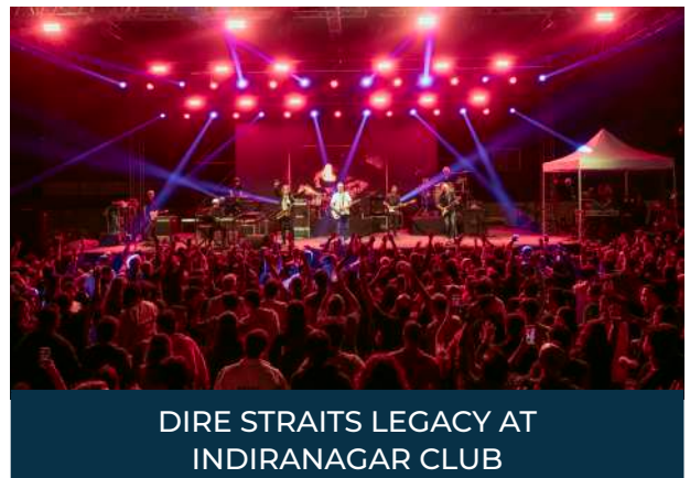
DIRE STRAITS LEGACY AT INDIRANAGAR CLUB

On 14th January 2026, Indiranagar Club had the privilege of hosting Dire Straits Legacy for an unforgettable evening of classic rock. As Sultans of Swing, Money for Nothing, Romeo and Juliet and Walk of Life filled the air, members were swept into pure nostalgia. The energy was electric, the sing-alongs heartfelt and the applause unending. It was truly special to witness such legendary musicians on our stage, creating memories that will linger long after the final note.