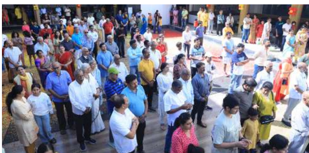
A MELODIOUS TRIBUTE TO KARNATAKA'S SPIRIT