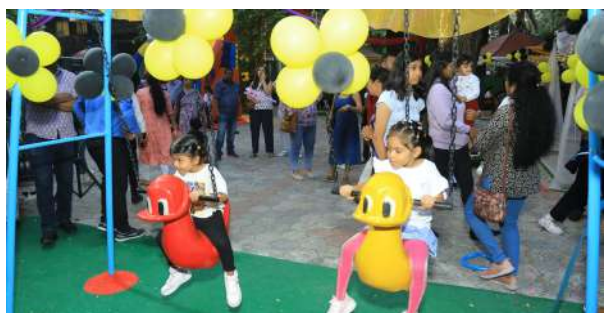
ROCKING AROUND THE CHRISTMAS TREE

The Club celebrated Children's Day on 15 November 2025 with a lively carnival and the inauguration of the new Children's Park. Magic shows, balloon artists, tattoos, caricatures, and a bouncing castle kept children entertained through the evening, while families enjoyed festive treats and games.