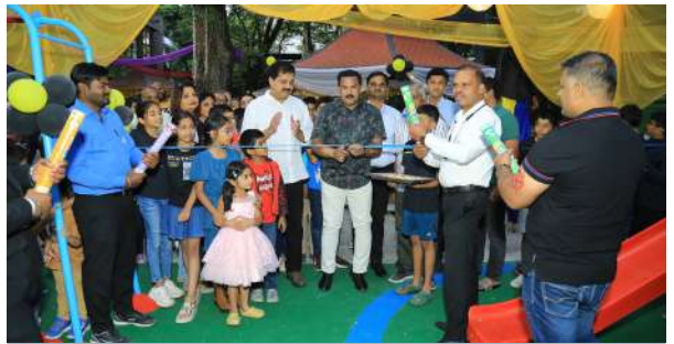
CHILDREN'S DAY CARNIVAL & PARK INAUGURATION

The Club celebrated Children's Day on 15 November 2025 with a lively carnival and the inauguration of the new Children's Park. Magic shows, balloon artists, tattoos, caricatures, and a bouncing castle kept children entertained through the evening, while families enjoyed festive treats and games.